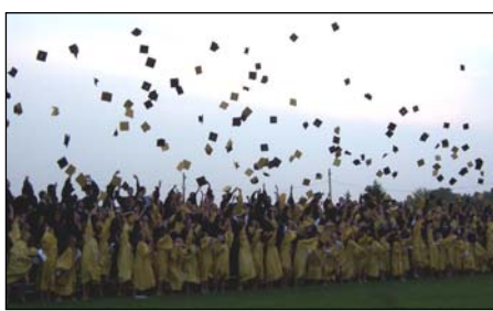
The 717 members of the class of 2007, the largest graduating class in Southern's history, give their hats the traditional celebratory toss at the end of the graduation ceremony.