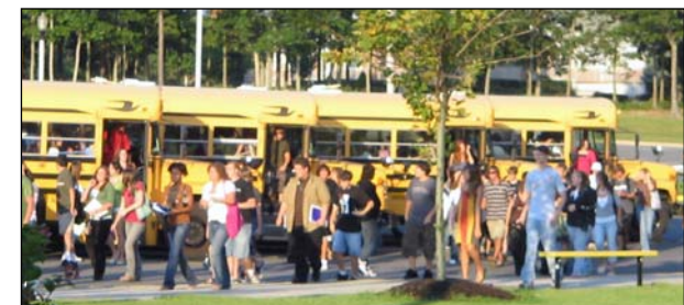
High school students exit busses on the first day of school, anxious to begin a new year and meet old friends. The traditional red carpet was rolled out to welcome them.

STYLE peer leaders are students who demonstrate good character traits. They are expected to continue to develop positive character traits, strive to do well academically, and reach out to help others in their school community over the next six years. Each must adhere to the STYLE Code of Responsibility.