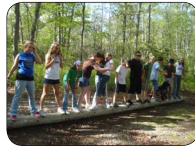
Students learn to develop trust as they participate in one of several team building activities during their training to become STYLE leaders.

Eight juniors, active in the HS program, were responsible for the training. They not only participated in the same discussions and activities as the seventh graders but also ran many of the activities. The high schoolers received extensive training on how to run these activities in addition to empathy training, healthy relationship training, peer mediation training, interpersonal skills training, public speaking training, and intergenerational training.